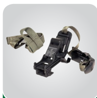
MICH HELMET MOUNT KIT ACGOPS15HMNP