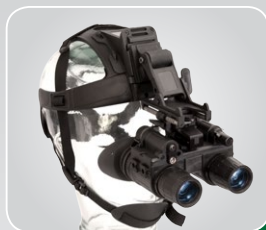
PS15 WITH HEAD MOUNT ASSEMBLY

** Specifications are provided for informational purposes only. Actual values may vary