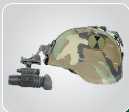
PS15 WITH HELMET MOUNT ASSEMBLY