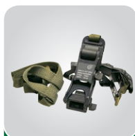
PADST HELMET MOUNT KIT ACGOPS15HMNP