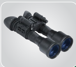
PS15 WITH 3X LENS