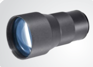
3X Lens (Optional)