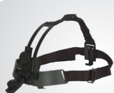
Universal Helmet Mount (Optional)