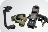
PAGST or MICH Helmet Mount (Optional)