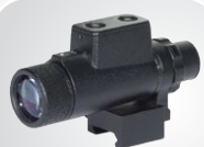
Long range IR-450 (Optional)