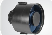
8X Lens (Optional)